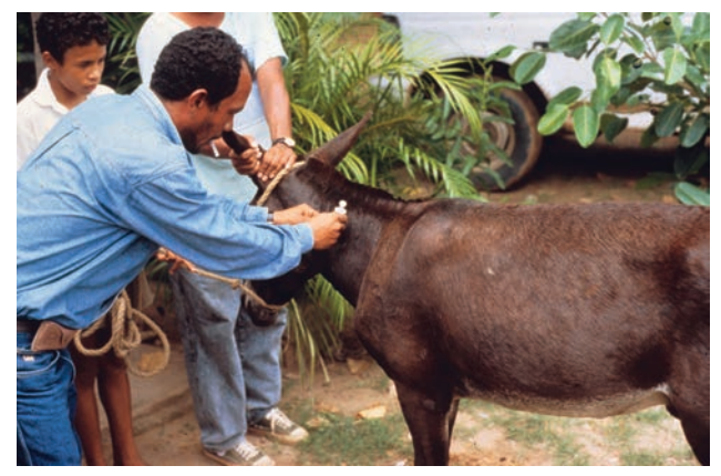
Figure 20-2. This photograph was taken in 1995 near Maicao, Colombia. Equine vaccination is the most effective means available to prevent Venezuelan equine encephalitis (VEE) epizootics as well as to control emerging outbreaks. Equines are the major amplifying hosts, and maintaining a high rate of immunity in the equine population will largely prevent human infection with the epizootic strains of VEE. Both inactivated and live attenuated vaccines are available for veterinary use, but the ability of the live attenuated vaccine to induce immunity in 7 to 10 days with a single inoculation makes it the only practical vaccination strategy in the face of an outbreak. Other measures used to control outbreaks include using insecticides to reduce mosquito populations and prohibiting the transportation of equines from affected areas.

Figure 20-1. This photograph was taken in 1995 near Buena Vista, Colombia. During large Venezuelan equine encephalitis (VEE) epizootics, typical morbidity rates among unvaccinated equines are 40% to 60%, with at least half of the affected animals progressing to lethal encephalitis. Note the disruption of the ground surface, which is caused by the characteristic flailing or swimming syndromes of moribund animals. Although clinically indistinguishable from the syndromes produced by eastern equine encephalitis and western equine encephalitis viruses, the capability of VEE to initiate explosive and rapidly expanding epizootics makes reliable diagnostic tests essential for the initiation of appropriate veterinary and public health measures.